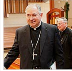
Latino to Lead Los Angeles Diocese

This week West Virginia expected an N.C.A.A. victory. Instead, it got the worst mine disaster in years.